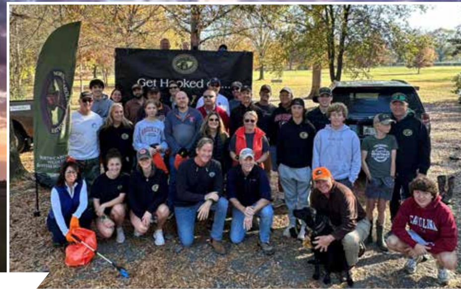
November 19, 2023: The North Carolina Wildlife Habitat Foundation Future Generations, Board Members, and Gate City Rotary Club Volunteers conducted their third annual Daffodil bulb planting in Latham Park in Greensboro.

To date, a grand total of 5000 bulbs were planted to enhance wild bee habitat in Greensboro.