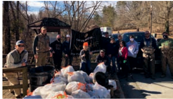
February 6, 2021: Future Generations Cleanup at Cypress Park Stream in Greensboro

The North Carolina Wildlife Habitat Foundation's Future Generations Program offers volunteer opportunities for young adults to develop leadership skills and positively impact the environment through local clean ups and habitat projects. The Future Generations also volunteer at the Annual Wildlife Extravaganza, the Annual Youth Sportsman Camp, and at various fundraising and community events.